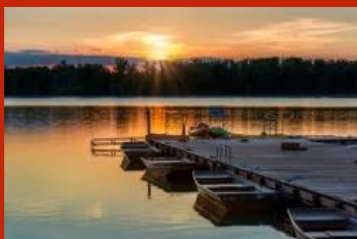
Rankin Lake Park

This past week's Plein Air outing was at Rankin Lake in Gastonia, where we were able to practice our rippling water techniques.